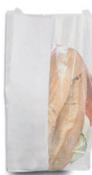
Half & half